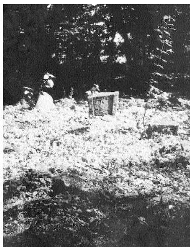
Desecrated graves in the Graveyard.