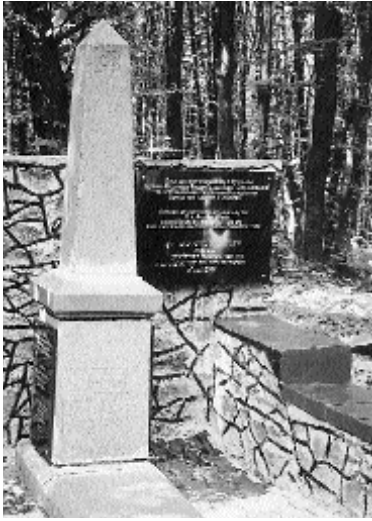
Israel Friedlaender restored monument.

their appearance was drastically different from the Ukrainian Jews.